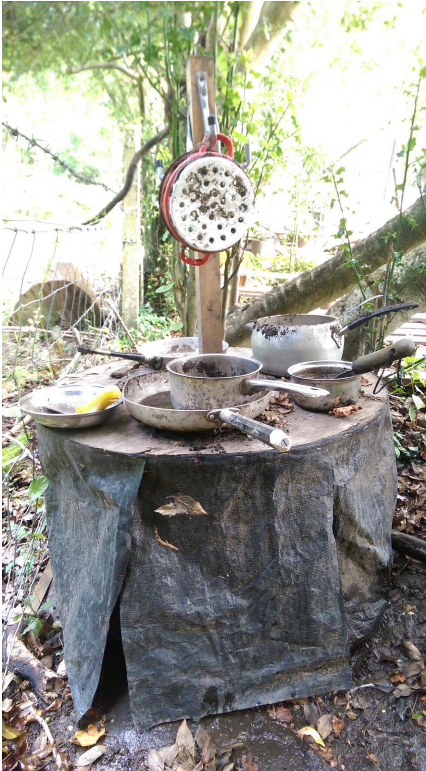
A cable drum, old pots and pans, part of a tent for the curtain, reclaimed hooks etc for a mud kitchen. Nothing new.