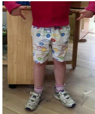
Self styled dressing up , made from fabric scraps and old clothing.