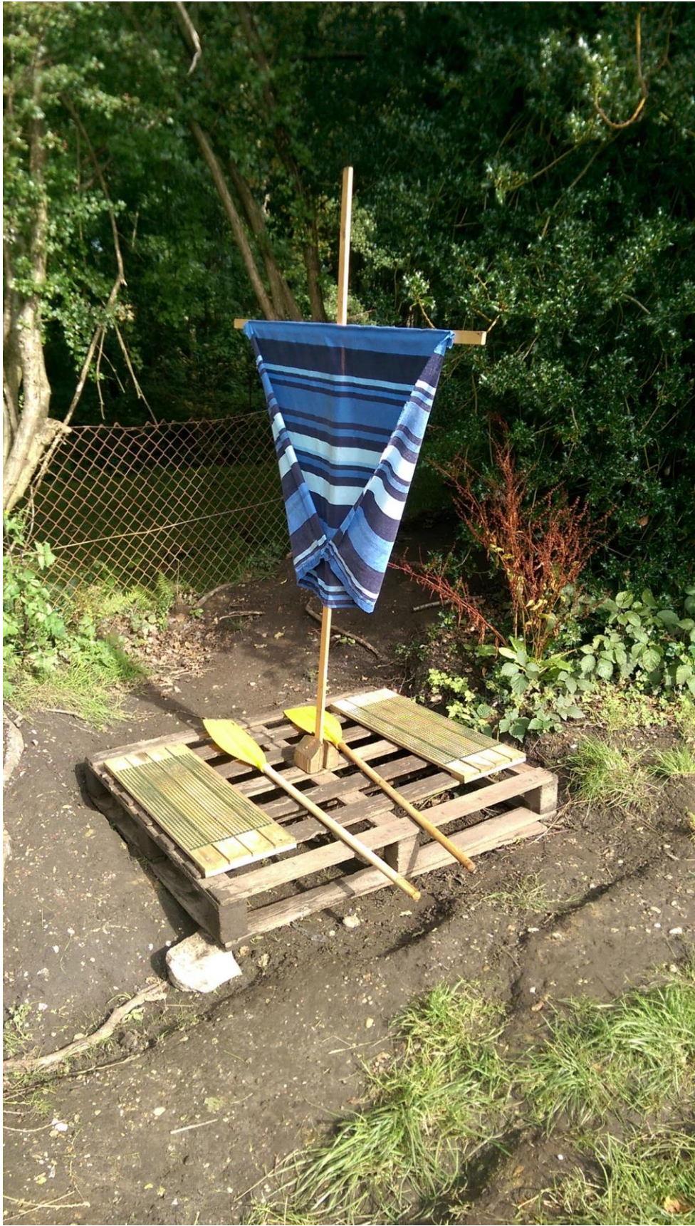
Outdoor play using pallets!