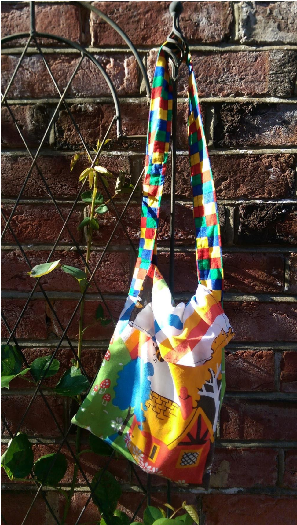
Bags made from fabric remnants.