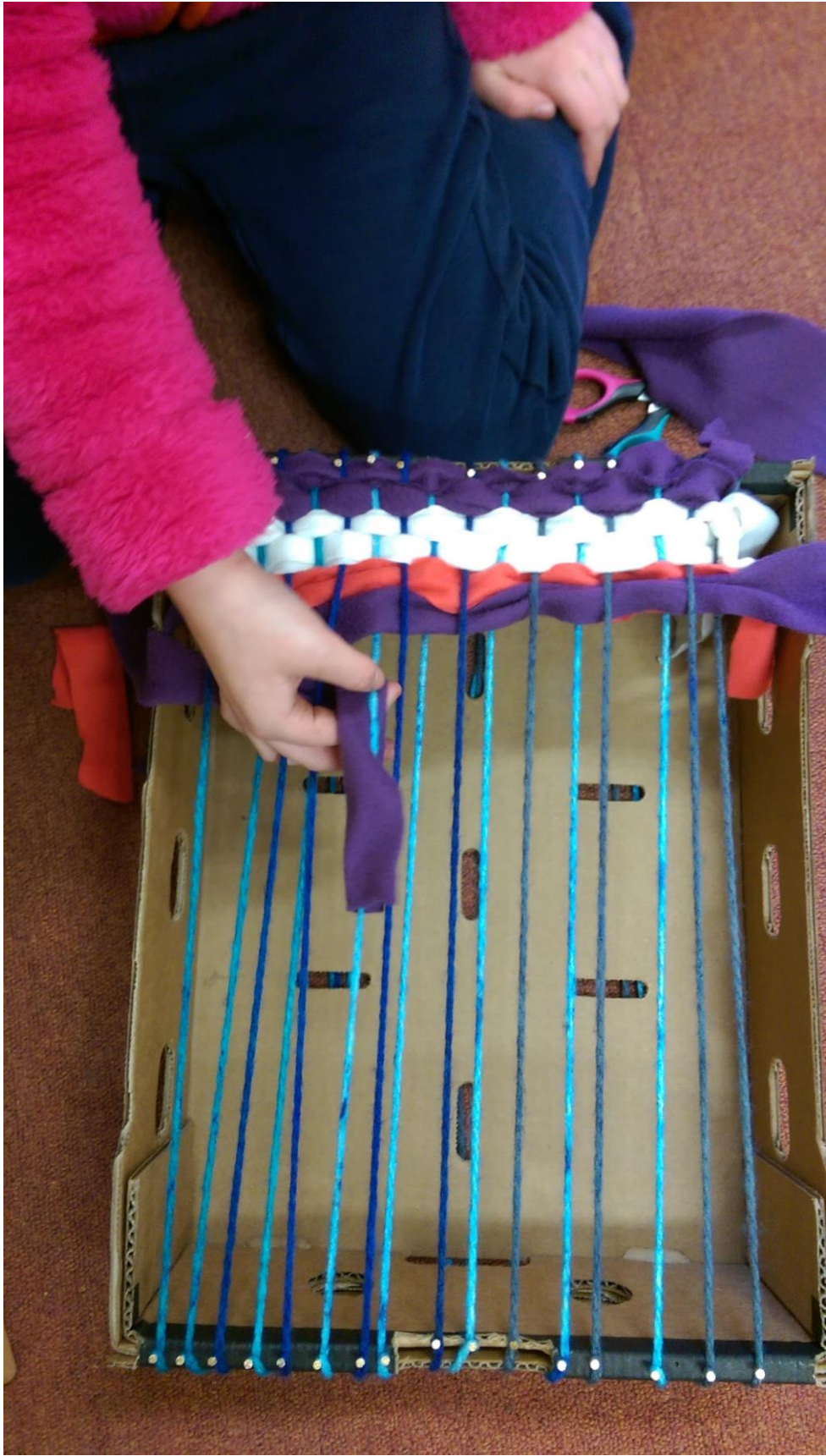
Learning to weave using second hand wool, fabric scraps and a cardboard box for the supermarket